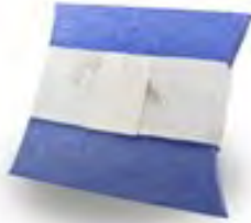
Journey Earth Urn Aqua Blue Butterworth Urn Co 1410