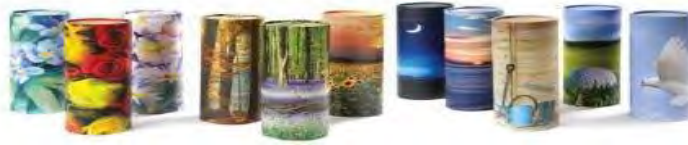
Scattering Tubes Available Gravure Craft