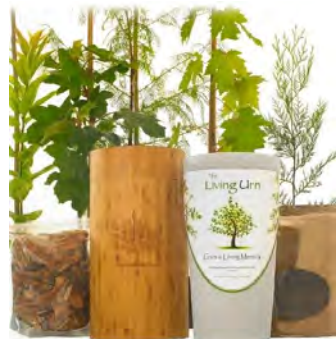
Bio Tree Urn The Living Urn Co. *Comes With Tree*