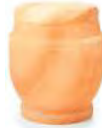
Himalayan Rock Salt Urn Butterworth Urn Co 7030