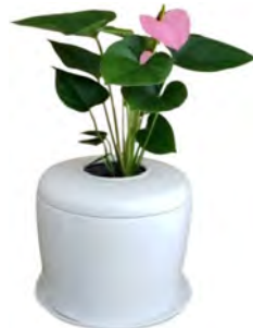
Bio Tree Urn The Living Urn Co. *Comes With Tree*