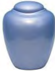
The Oceane Aqua Dodge Urn Co. 950250