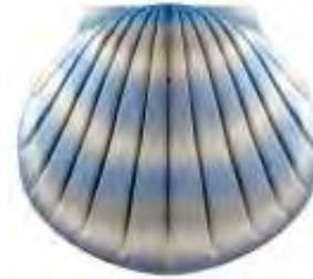
The Aqua Shell Eckels ECKAS225